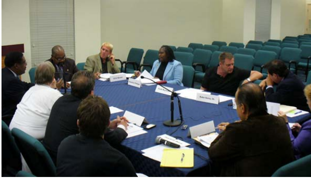
CRA Advisory Committee Meeting