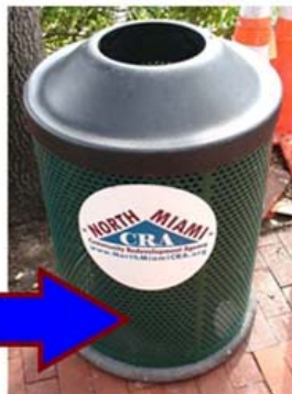
Helping in the effort to keep North Miami clean

Litter along commercial streets and sidewalks gives a negative impression and can greatly affect the economic development of an area. In North Miami matters were made worse by unsightly litter containers with cracked lids and an old design. In 2005-06 the CRA funded the purchase and installation of 53 modern, colorful trash cans