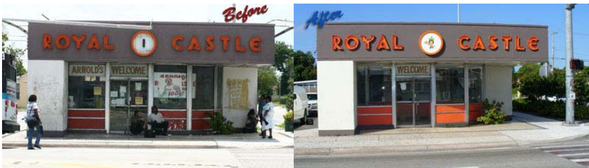
Commercial Rehabilitation Grant Example- Royal Castle – 12490 NW 7 Avenue

CRA Supported City Efforts – During FY 2006-07 CRA supported the City of North Miami’s successful effort in November 2006 to amend its Charter to remove height and density limitations from the charter and to have height and density governed by the City comprehensive development plan, prepare a new Comprehensive Development Master Plan (CDMP), and to rewrite its Land Development Regulations (i.e. Zoning Code). The CRA also supported the City’s request for inclusion of the approximately 193-acre Biscayne Landing master planned development in the Miami-Dade County State-designated Enterprise Zone.