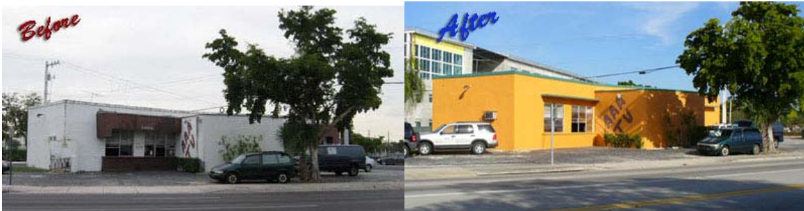
Commercial Beautification Grant Example: AAA TV– 13050 W Dixie Hwy