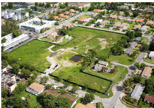
Pioneer Gardens land prepared for development

Affordable Housing – At the heart of the CRA’s mission is the provision of affordable housing for the residents of the City of North Miami. The CRA is continuing to make progress toward the development of the Pioneer Gardens affordable housing development. Pioneer Gardens will be comprised of 136 new residential condominiums, and represents just one aspect of the CRA’s overall affordable housing effort, which includes the rehabilitation of existing homes, providing purchase subsidy assistance to first-time homebuyers, preserving apartments as affordable rental housing and building new homes.