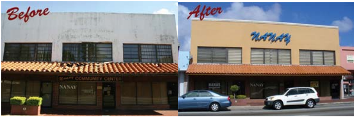
Commercial Beautification Grant Example: Nanay – 659 NE 125 ST