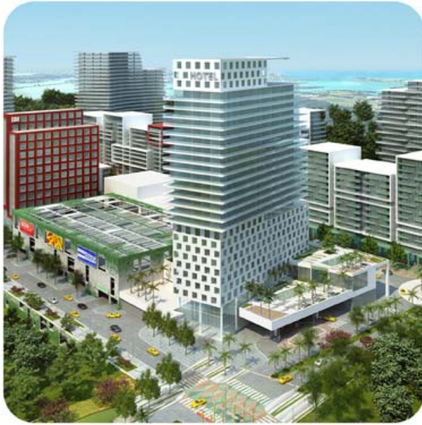
Artist rendering of Biscayne Landing

CRA's are a common governmental tool for redevelopment in Florida, and they operate on a budget generated by the increase in property tax revenue within the area. Once the CRA is established, a percentage of the increase in real property taxes goes to the CRA. This tax increment is used to fund and finance the redevelopment projects outlined in the Community Redevelopment Plan.