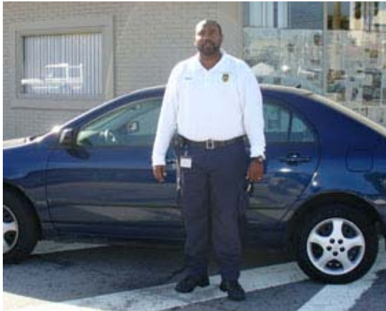
Enhanced Code Enforcement Program Officer

The continuation of the Commercial Corridor Improvement Program was funded in the FY 2006-07 budget in the amount of $550,000 and is further funded in the FY 2008-09 budget in the amount of $400,000. This funding continues to support (1) a full-time, three-person Clean Team responsible for pressure cleaning of sidewalks, litter control, graffiti removal and other pro-active clean-up activities within the CRA district; and (2) a full-time, dedicated Code Enforcement Officer for an Enhanced Code Enforcement Program within the CRA boundaries with an emphasis on the commercial corridors.