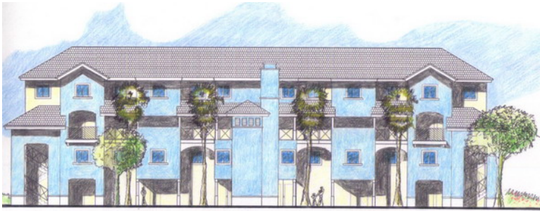
Artist Rendering of Pioneer Gardens Residential Condominiums

On the financing side, the CRA successfully issued a request for proposals for a $10.7 million line of credit, which will help to fund project development costs and purchase subsidies for eligible homebuyers. Miami-Dade County approved the CRA's request for authorization to enter into the proposed line of credit