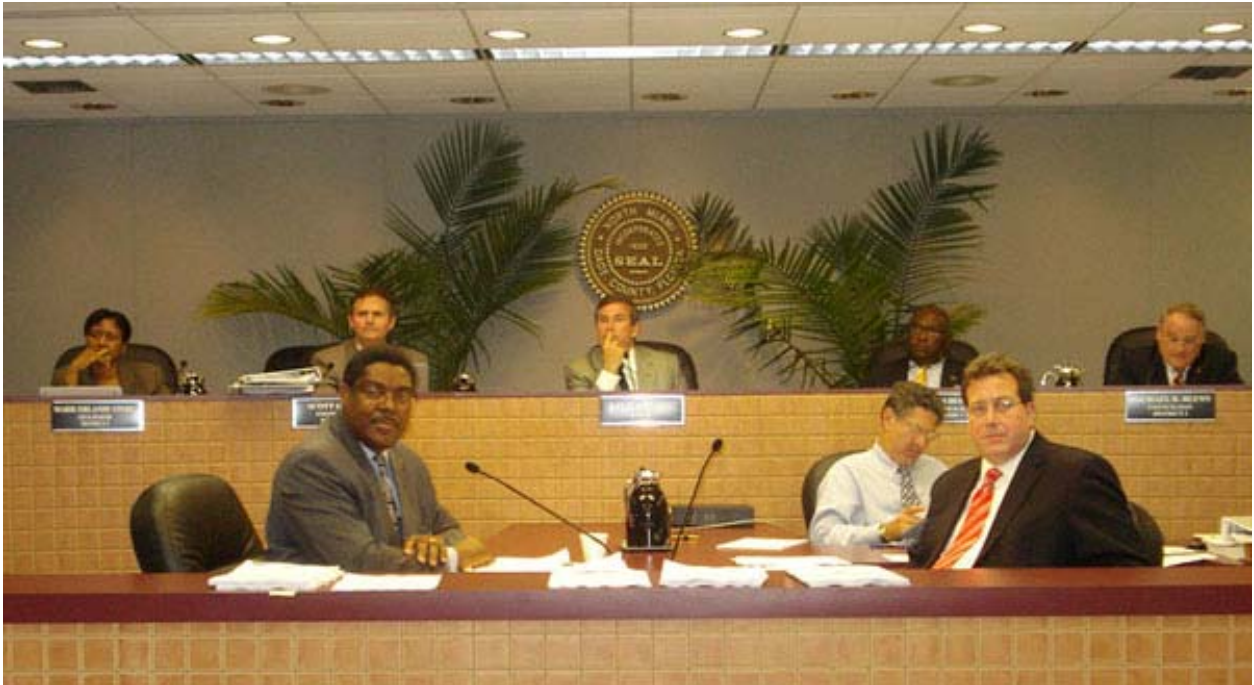
The CRA Board and Executive Staff at a regular monthly CRA Board Meeting

The CRA was fully created through appropriate City and County legislation in June 2005 and started its operations in August 2005, led by a consulting Executive Director, assisted by two full-time staff members (i.e. Assistant Director and Special Projects Manager), two consultants, and a “launch team” including the CRA Board Attorney, Bond Counsel and Financial Advisor. After several months sharing space with the City of North Miami’s Purchasing Department, the CRA secured its own office location. The first task for CRA staff was to organize the process and procedures for the CRA Board meetings that commenced on August 9, 2005. Next, a CRA Advisory Committee was established and operating rules were prepared and adopted. The CRA Advisory Committee held its initial meeting on February 9, 2006.