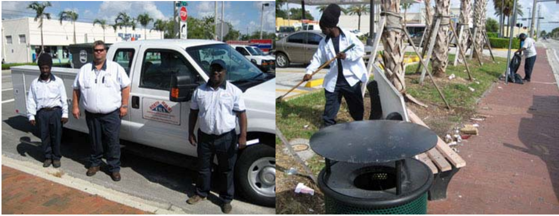
The North Miami CRA dedicated 'Clean Team'

The continuation of the Commercial Corridor Improvement Program was funded in the FY 2006-07 budget in the amount of $550,000 and is further funded in the FY 2008-09 budget in the amount of $400,000. This funding continues to support (1) a full-time, three-person Clean Team responsible for pressure cleaning of sidewalks, litter control, graffiti removal and other pro-active clean-up activities within the CRA district; and (2) a full-time, dedicated Code Enforcement Officer for an Enhanced Code Enforcement Program within the CRA boundaries with an emphasis on the commercial corridors.