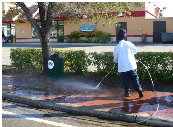
Pressure cleaning of sidewalks on NE 6th Ave

continues to be committed to improving the general condition of the City's main commercial corridors within the CRA Boundaries - NE 125th Street, NE 6th Avenue, West Dixie Highway, and NW 7th Avenue. The initial implementation of the Commercial Corridor Improvement Program (CCIP) was funded in the CRA 2005-06 budget and was kicked off with the Pressure Cleaning of the sidewalks in downtown North Miami in August 2006. In addition to pressure cleaning, during 2005-06 the CRA took steps to improve the overall appearance of downtown that included the removal of bulky concrete street furniture